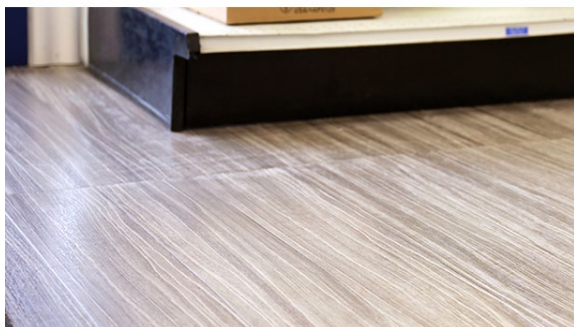
//Freedom Before & After Ice Melt Residue (1 Application