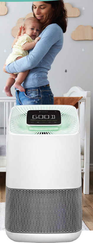
Active HEPA+ Room Item #: 1X5825