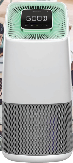
Active HEPA+ Pro Item #: 1X5826

*Laboratory tests prove to inactivate over 99.98% of SARS-CoV-2 in the air. Result achieved in 3 minutes and 20 seconds (approx. 10 air exchanges). Independent testing completed at MRIGlobal using a primary aerosol containment system within a Class III biological safety cabinet.